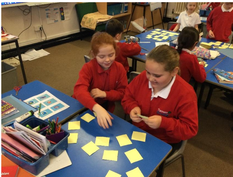
Games help the children to recall key vocabulary. Here, Year 4 children are playing a pairs game together.