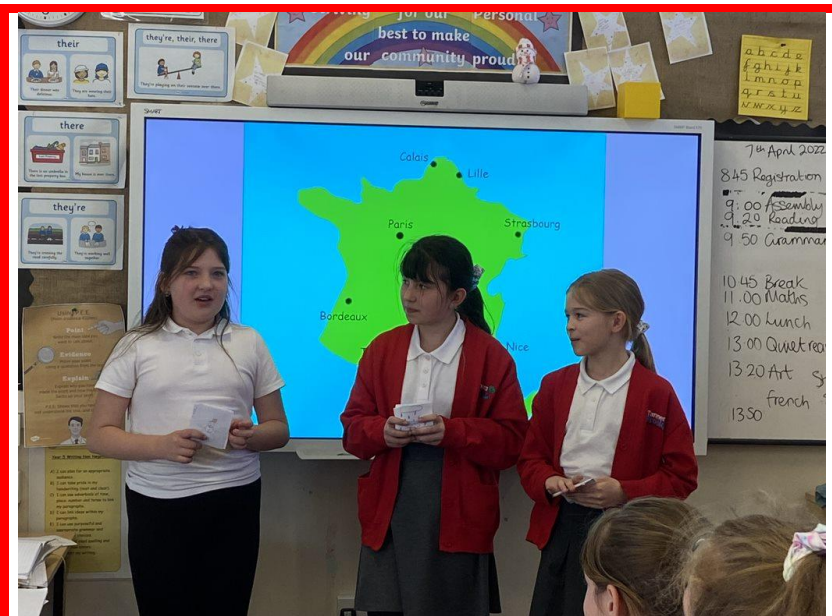
Year 5 children presenting their own weather forecast for France.